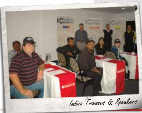
Imbizo Trainees & Speakers