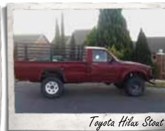
Toyota Hilux Stout