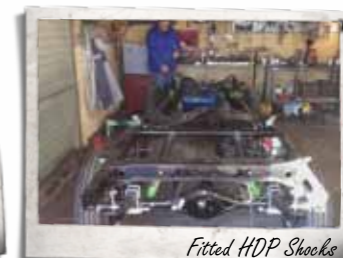
Fitted HDP Shocks