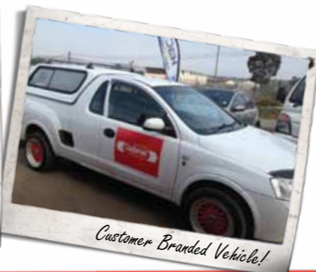
Customer Branded Vehicle!